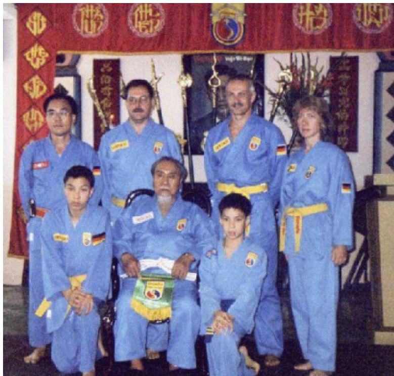
2003-Jul: Visiting Tổ Đường - Ho-Chi-Minh-City, Vietnam [10]