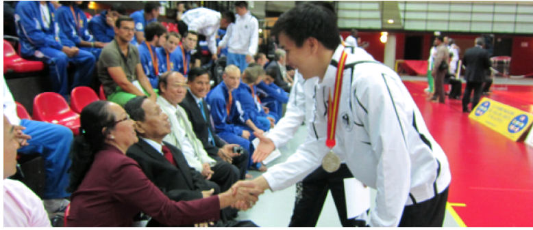
2013-Jul: Participation in the 3 rd WVVF World Championship - Paris, France [10]