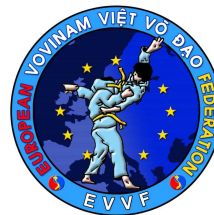
European Vovinam Việt Võ Đạo Federation