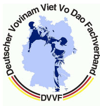
Deutscher Vovinam Viet Vo Dao Fachverband