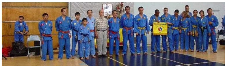
2002-Jul: Participation in the Vovinam Overseas Tournament, California, USA [10]