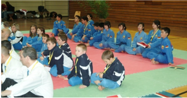
2007-Nov: German National Team at European Championship - Geneva, Switzerland [10]