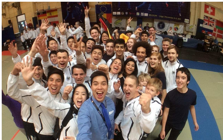
2015-Nov: Group Photo of German National Team at the 1 st European Youth Championship - Liege, Belgium [7]