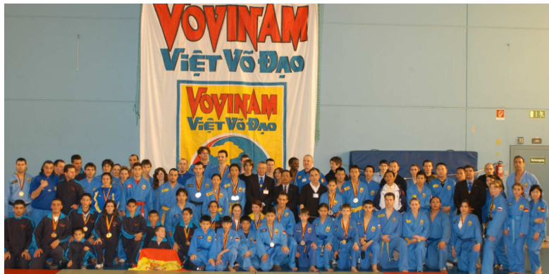
2004-Apr: Group Photo at the Intercontinental Championship - Frankfurt, Germany [10]