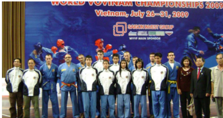
2009-Jul: German National Team at WVF World Championship - Ho-Chi-Minh-City, Vietnam [10]