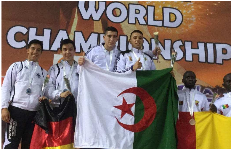
2015-Jul: European Athletes at the 4 th WVVf World Championship - Algiers, Algeria [9]