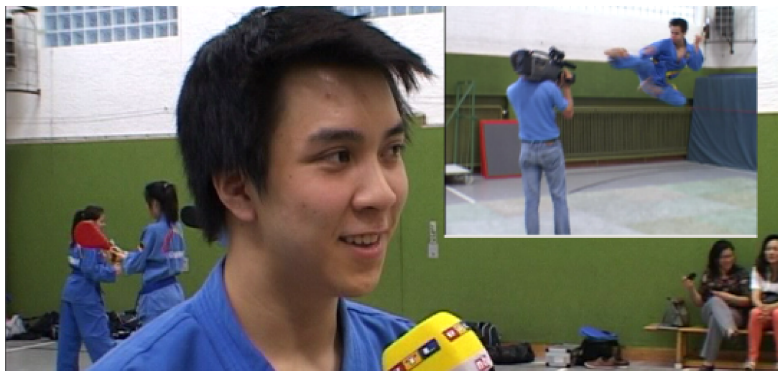
2012-May: Interview for a National TV channel - Frankfurt, Germany [10]