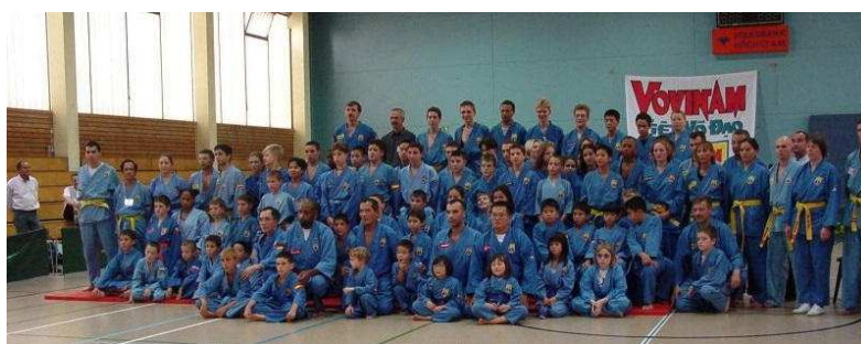
2001-Oct: Group Photo at the International Children Championship - Frankfurt, Germany [10]