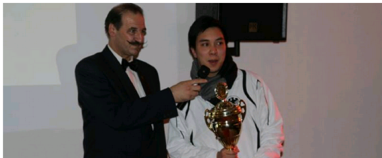
2014-Jan: SG Nied Club Internal Award for Best Male Athlete 2014 - Frankfurt, Germany [10]