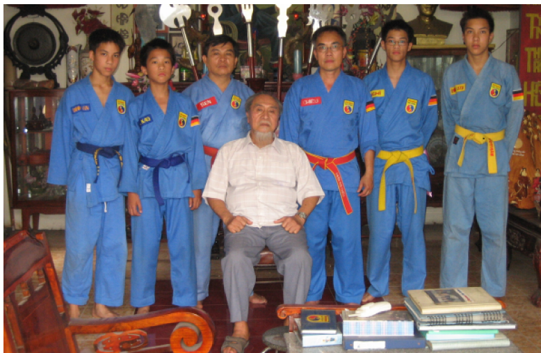
2005-Aug: Visiting Tổ Đường - Ho-Chi-Minh-City, Vietnam [10]