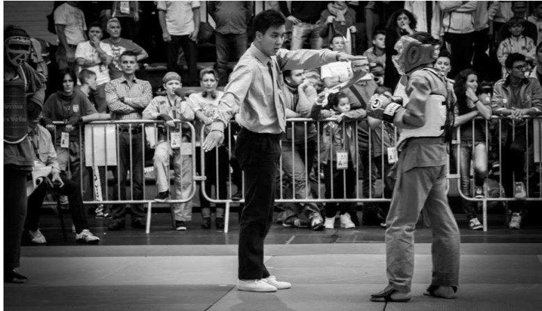
2015-Nov: Center Referee at the 1 st EVVF Youth Championship - Liege, Belgium [8]