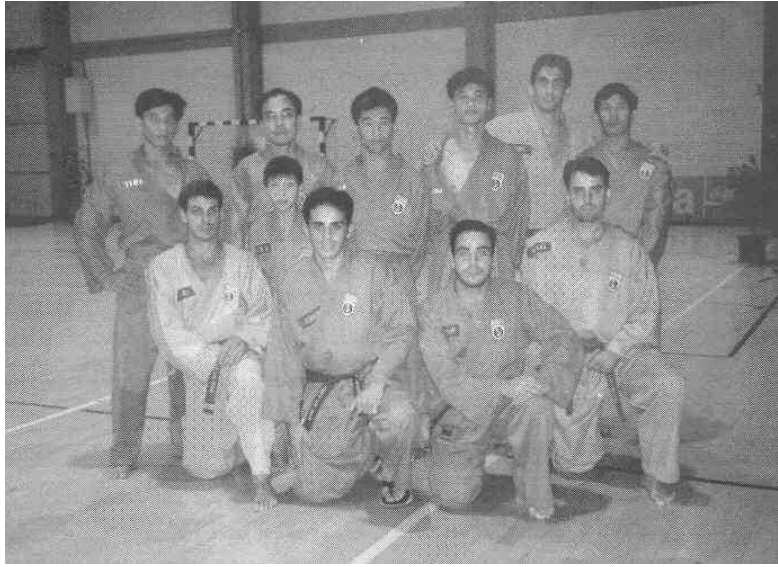
1998-Nov: First participation in an International Championship - Tenerife, Spain [12]