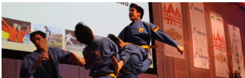
2011-Mar: Demonstration at Frankfurt's Award Ceremony for Best Athletes - Frankfurt, Germany [10]