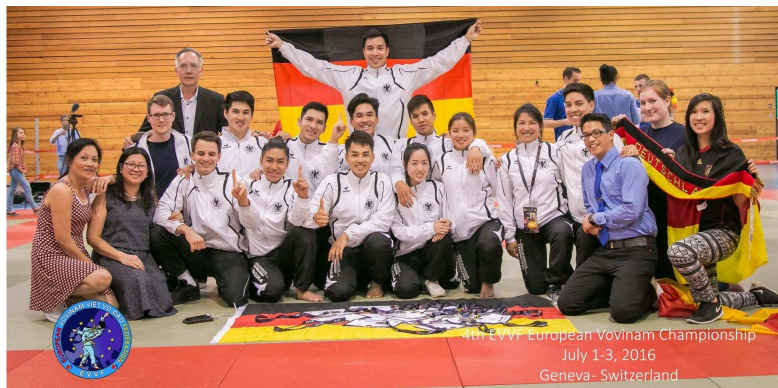
2016-Jul: Group Photo of German National Team at the 4 th European Championship - Geneva, Switzerland [4]