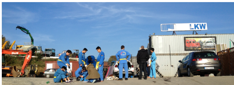
2014-Nov: Participation in a Film shooting for a Bachelor Thesis - Würzburg, Germany [10][11]