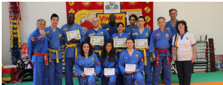
2014-Jun: Visiting a Belt Examination of the Swiss Vovinam Federation - Geneva, Switzerland [10]