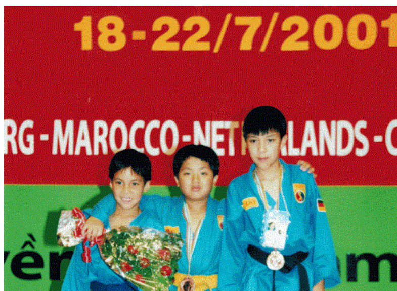
2001-Jul: Participation in the International Championship - Ho-Chi-Minh-City, Vietnam [10]