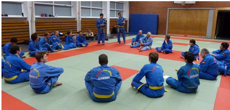
2017-Jan: National Referee Seminar - Langenhagen, Germany [2]