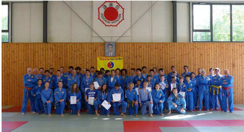
2016-Oct: Open Fighting Championship - Munich, Germany [2]