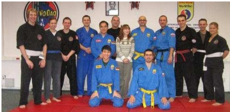
2006-Oct: Visiting and Training with a Polish delegation - Warsaw, Poland [10]