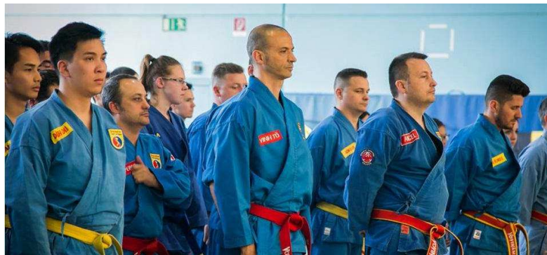
2016-May: 3 rd EVVF Seminar - Frankfurt, Germany [6, 7]