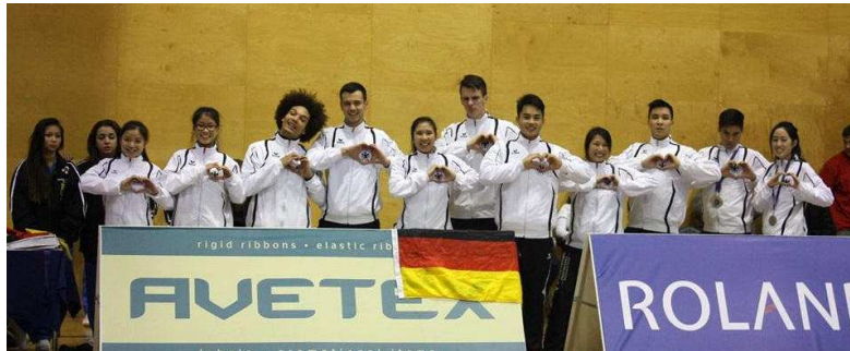
2014-Jun: Group Photo of the German National Team at the 3 rd EVVF European Championship - Warsaw, Poland [10]