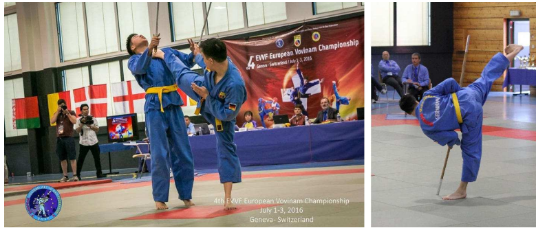
2016-Jul: Performance of Song Luyện Kiếm & Tứ Tượng Côn Pháp at the 4 th European Championship - Geneva, Switzerland [5]