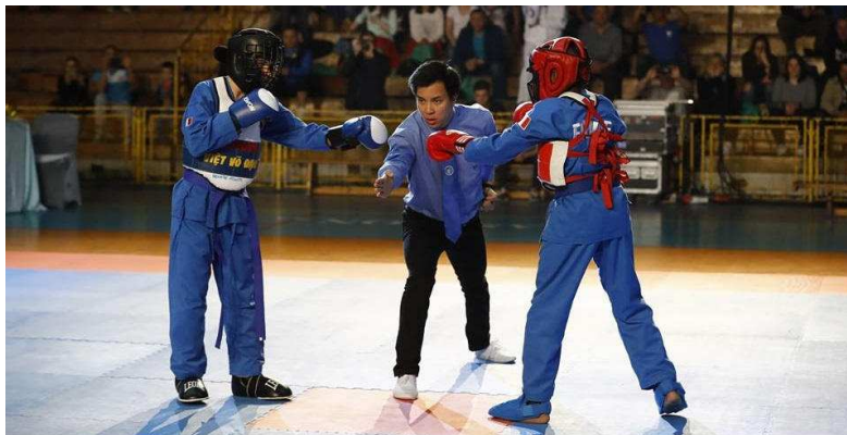
2017-Apr: Center Referee at the 2 nd EVVF Youth Championship - Iasi, Romania [3]