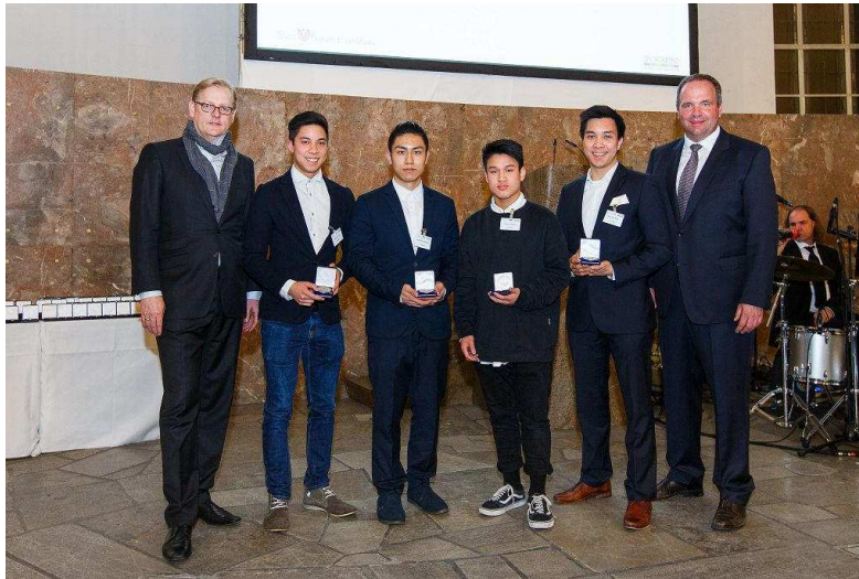
2017-Mar: Frankfurt's Award Ceremony for Best Athletes - Frankfurt, Germany [1]